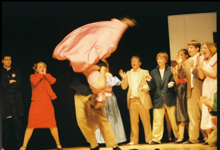
West Side Story