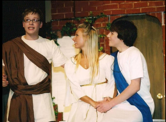
A Funny Thing Happened on the Way to the Forum