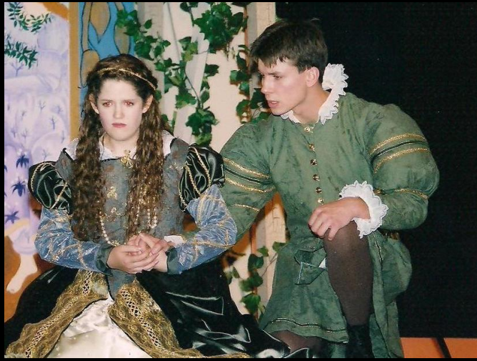
Beatrice and Benedick