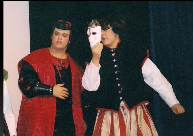
Don John and Borachio